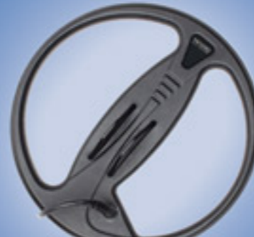
C28 Coil (Standard Package) 28 cm (11") 550 gr (1.2 lb.) (19.4 oz.)