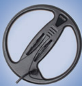
C23 Coil (Pro Package) 23 cm (9") 460 gr (1 lb.) (16 oz.)